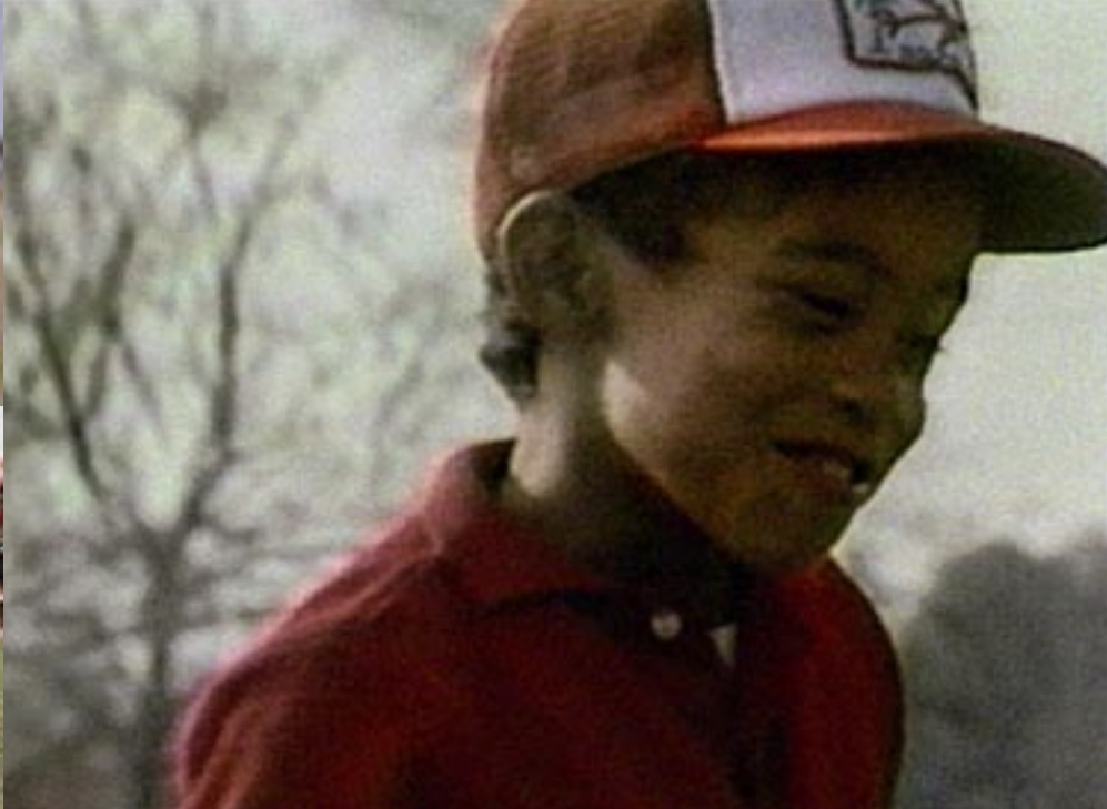
Nike's "Kid Tiger".

Throughout the open, a live action camera dollies in a continuous move giving viewers a glimpse of life on the streets of ancient Rome—a woman carrying a basin, a man and a boy walking through pillars, and friezes carved into the walls. A52 used the Flame 3D tracking tool for precision tracking of that live camera move in order to position colorful, animated, CG stick figures so that they appear to be graffiti dancing on the walls.